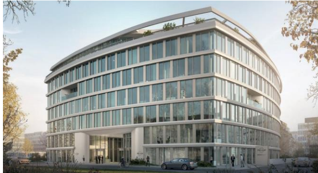
THE OVAL • Dusseldorf