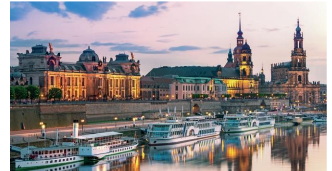
QUARTERS AT BLÜHERPARK • Dresden