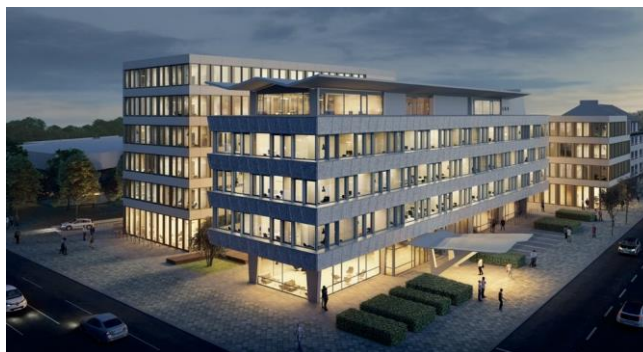
CAVALLO • Dusseldorf