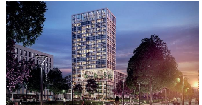
DEUTZ QUARTERS • Cologne