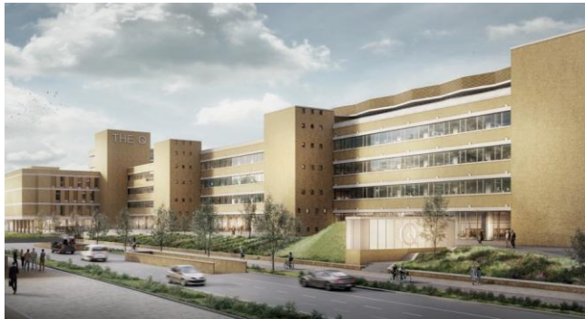
THE Q • Nuremberg