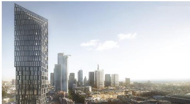
DAS PRÄSIDIUM • Frankfurt