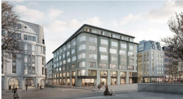
LAURENZ CARRÉ • Cologne